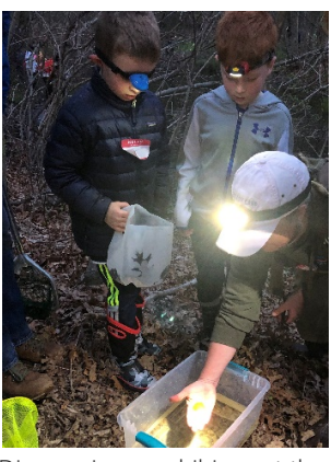
Discovering amphibians at the Peeper Prowl