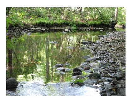
Scenic view at the Dowd property