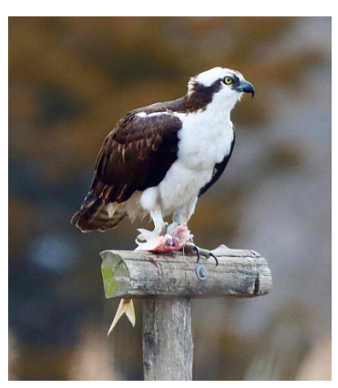
Osprey at one of our platforms