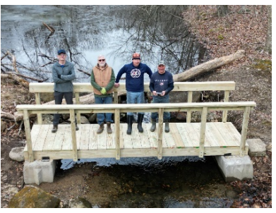
New bridge at Boulder Creek

CLCT is a nonprofit organization that depends on your generosity to acquire additional property and provide educational programs. Please consider making a financial contribution of a donation of property, which will go a long way towards protecting and preserving precious land now and for future generations.