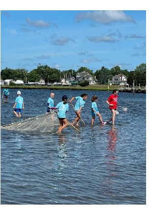
Beach seining at Ecology Camp